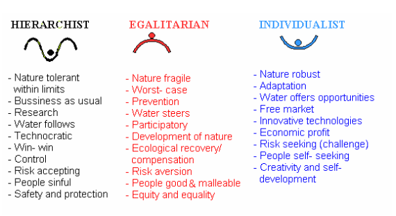
Figure 1. Overview of perspectives (van Asselt, 2000; Valkering et al., 2007) derived from Cultural Theory (Thompson et al., 1990).

Different possible futures can be envisaged, depending on the perspective people may have. Different perspectives in turn will lead to the adoption of different water management strategies. According to Cultural Theory, three stereotype perspectives can be distinguished: the hierarchical (hie), egalitarian (ega) and individualist (ind) perspective (Fig. 1).