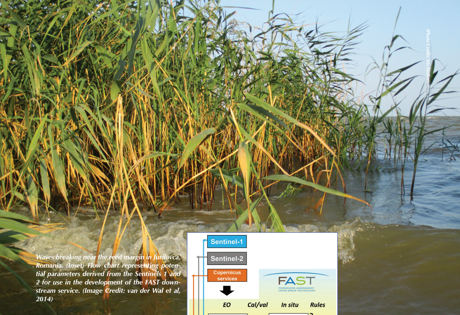
Waves breaking near the reed margin in Jurilovca, Romania. (Inset) Flow chart representing potential parameters derived from the Sentinels 1 and 2 for use in the development of the FAST downstream service. (Image Credit: van der Wal et al, 2014)