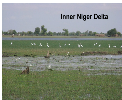
Inner Niger Delta

With the combination of a predicted drier future, the control and construction of reservoirs in the Niger and Bani headwaters, and the extension of irrigated agricultural areas in the Upper