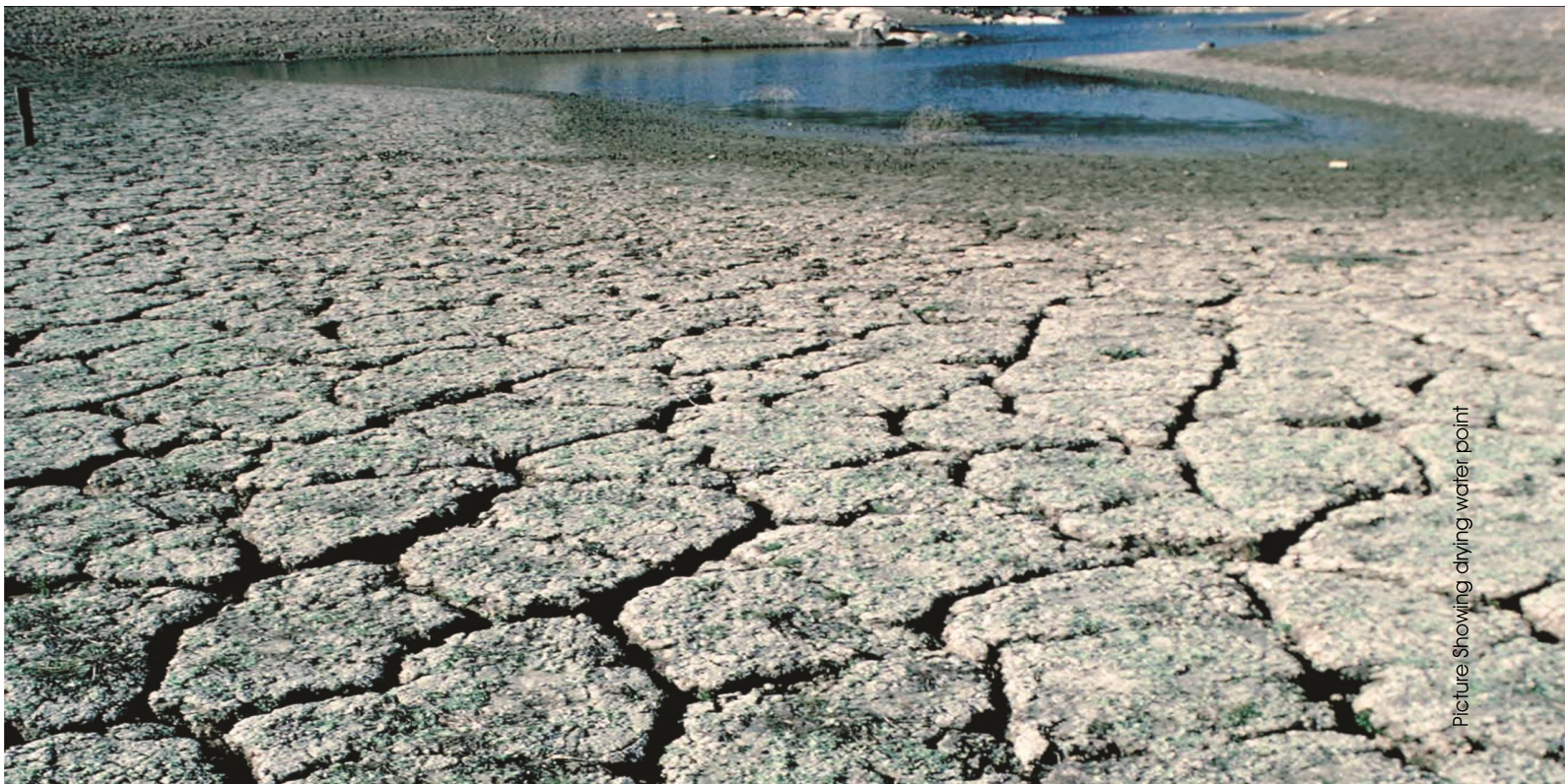
Picture Showing drying water point