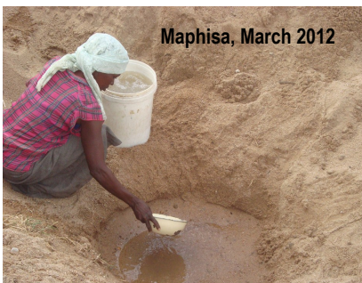
Maphisa, March 2012

Forecasts in the region are provided by institutions such as South Africa Weather Services, SARCOF, SADC Climate Services Centre and FEWSNET. The Limpopo Basin is characterised by extreme climate variability leading to severe droughts in the region.