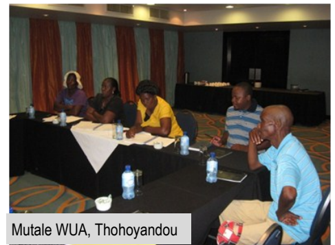
Mutale WUA, Thohoyandou

The stakeholders engaged in the meetings included the Limpopo River Basin Commission, USAID, World Vision International, Weather Services, Municipalities, Water Users Association, Large Water Users, Water Managers from Departments of Water and Agriculture.