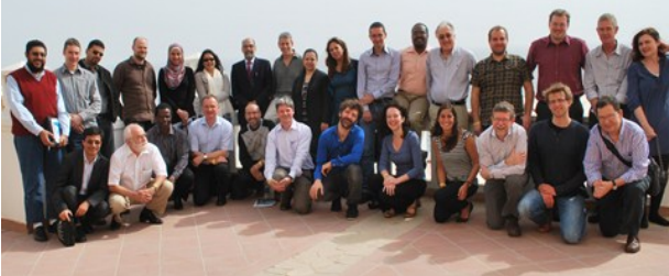
DEWFORA Consortium, Sharm-El-Sheikh, February 2012

Until our next newsletter, please visit our website regularly to keep track of project's progress, new and interesting results available for you to use in your research for example.