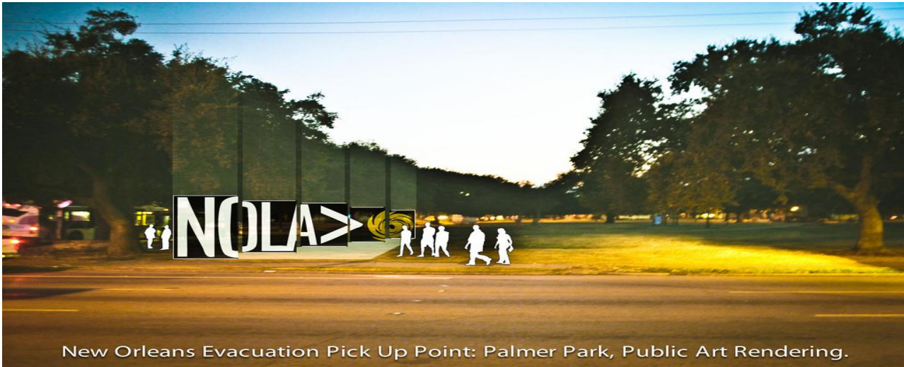
New Orleans Evacuation Pick Up Point: Palmer Park, Public Art Rendering.

"Evacuteer.org is an integral part of the City of New Orleans' hurricane evacuation strategy." - Mayor Mitch Landrieu