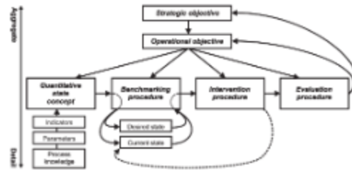
Basic Frame of Reference